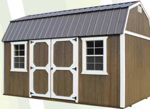
Painted Lofted Garden