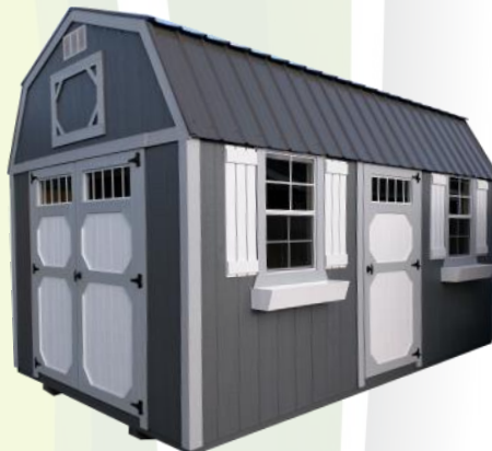
Deluxe Lofted Garden Shed