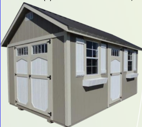
Deluxe Garden Shed With Roof Overhang