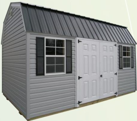
Vinyl Lofted Garden