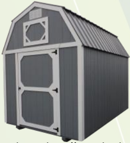
8ft wide with 46" single door.