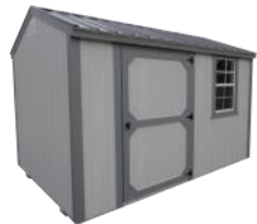
8ft wide with single door.