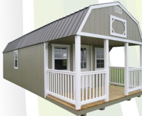
Standard Lofted Cabin