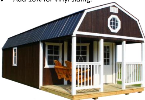
Add $700 for Deluxe Lofted Cabin. Includes 5ft swing and octagon loft window

6'6" Wall Height. Choice of 4ft or 6ft Porch.