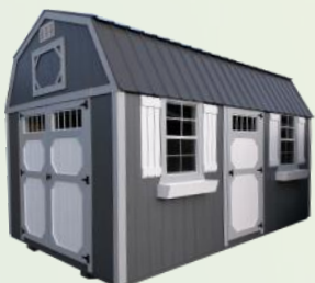
Deluxe Lofted Garden Shed