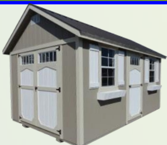
Deluxe Garden Shed With Roof Overhang