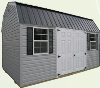
Vinyl Lofted Garden