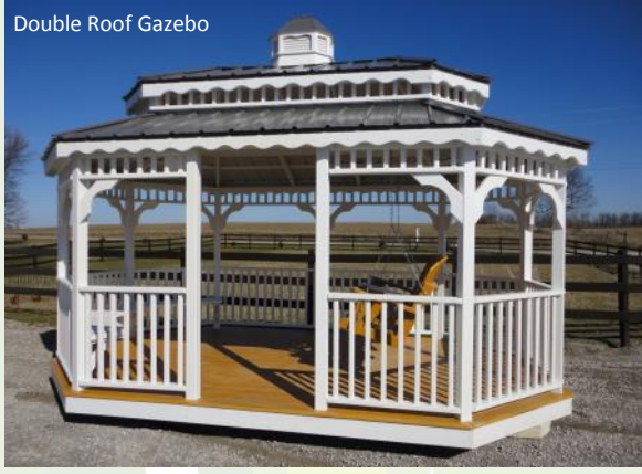
Double Roof Gazebo