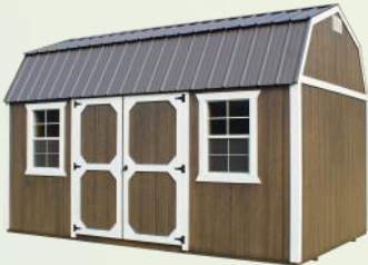
Urethane Lofted Garden