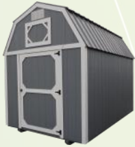
8ft wide with 46" single door.