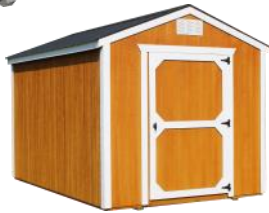
8ft wide with single door.