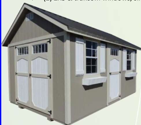
Deluxe Garden Shed With Roof Overhang