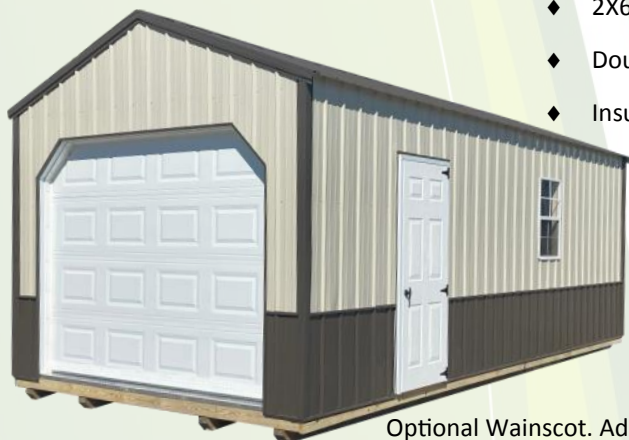
Optional Wainscot. Add $150.00