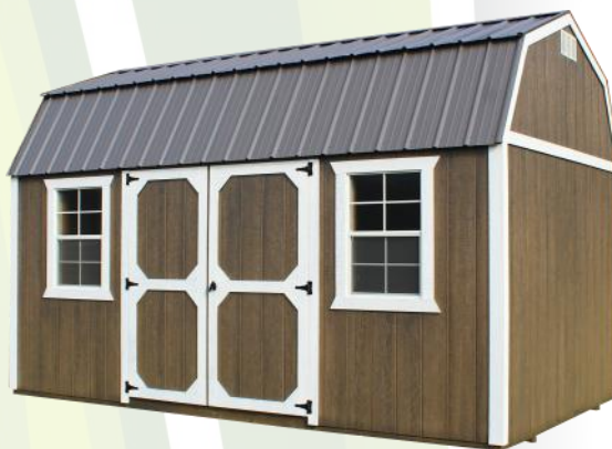
Painted Lofted Garden