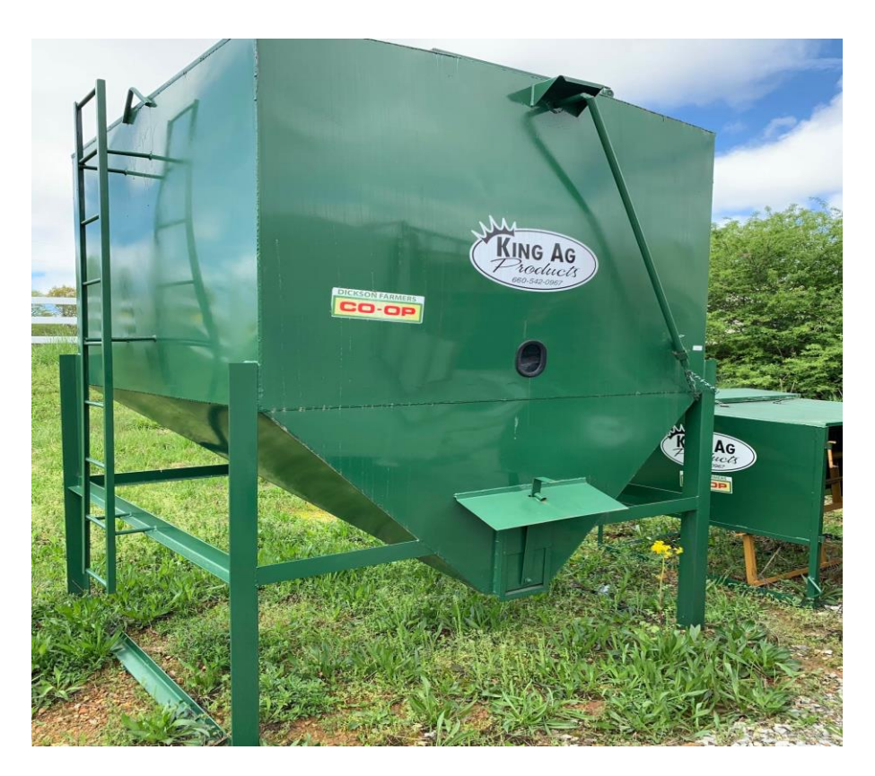
Item # KA1005 >>> King >Ag >5 >> ton >>> stationary >> bulk >> feed >>> bin >>>> $2,390.00