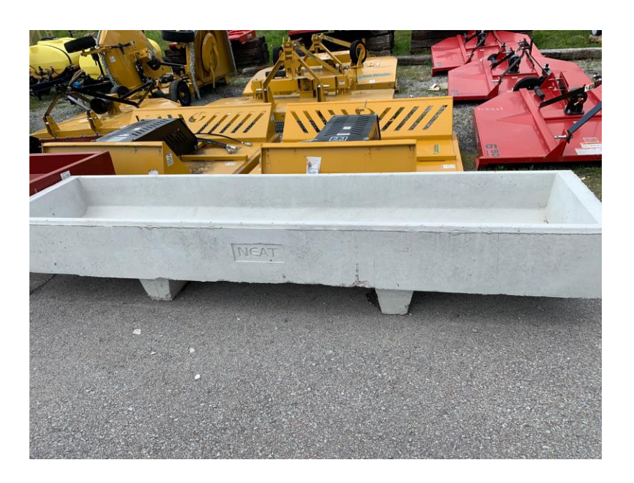
Item#FBF10 Tarter 10ft Concrete Bunk Feeder