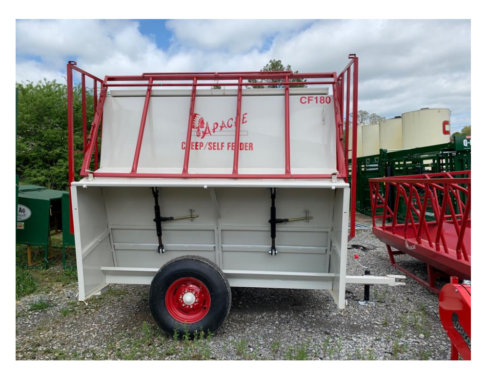
Item#27426 Apache Creep Feeder w/ Pens Springs Ratchets 180 bushels $4,450.00