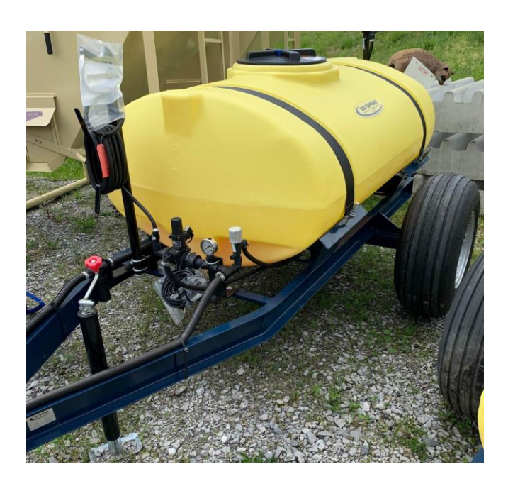
Item#73692 Ag Spray Pull Type sprayer 300 gallon Hamilton nozzle on trailer $3,399.00

300 Gallon Elliptical Tank Heavy Duty Low Profile Frame Pressure, Strainer & Agitation Assemblies 11L-15 Implement Tread Tires Hypro 8 Roller Pump PTO Driven (Max. 22.5 GPM) with Quick Coupler C 20 Hamilton Nozzle Electric Cut-off Hypro Gun