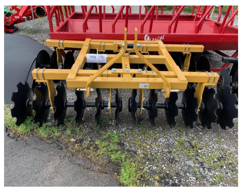
Item#80111330 Behlen 7 1/2ft Heavy Duty Disk $1,389.99