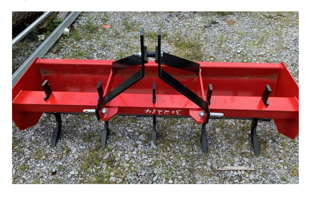
Item#302214 Kodiak 6ft box scraper $689.99

300 Gallon Elliptical Tank Heavy Duty Low Profile Frame Pressure, Strainer & Agitation Assemblies 11L-15 Implement Tread Tires Hypro 8 Roller Pump PTO Driven (Max. 22.5 GPM) with Quick Coupler C 20 Hamilton Nozzle Electric Cut-off Hypro Gun