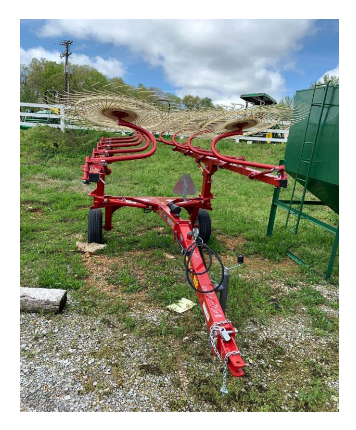
Item#28553 Sitrex Hay Rake 10 wheel $5,699.00