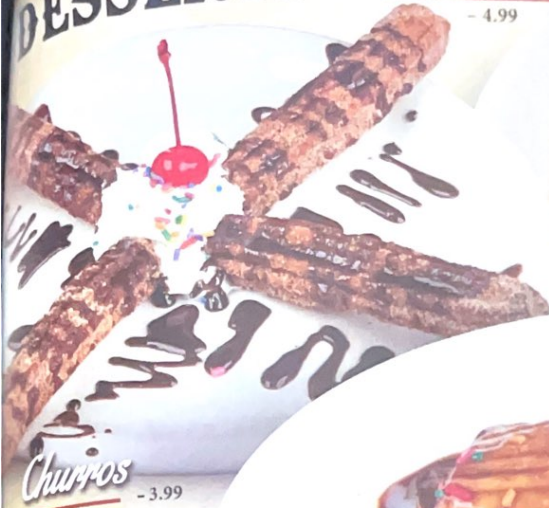
Churros - 3.99