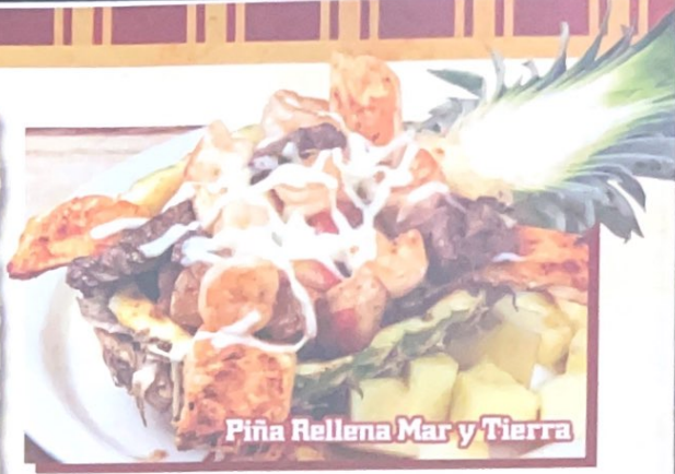
Piña Rellena Mar y Tierra

Carne asada, chicken bread, shrimp, charro beans, green onions, jalapeño pepper served in an authentic volcano stone dish - 18.99