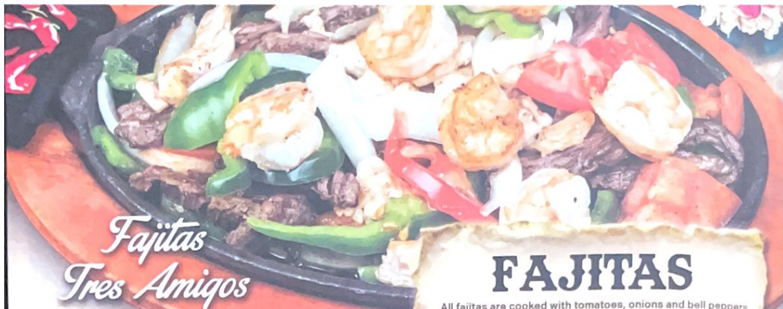
Fajitas Tres Amigos