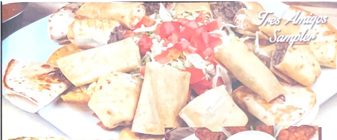
Tres Amigos Sampler