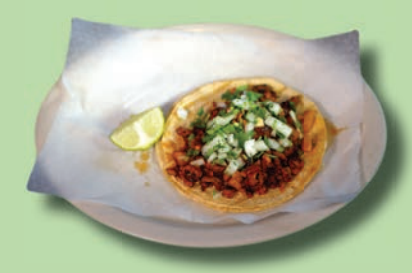
Taco al Pastor