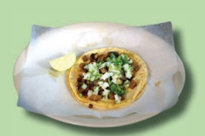
Taco de Carnitas