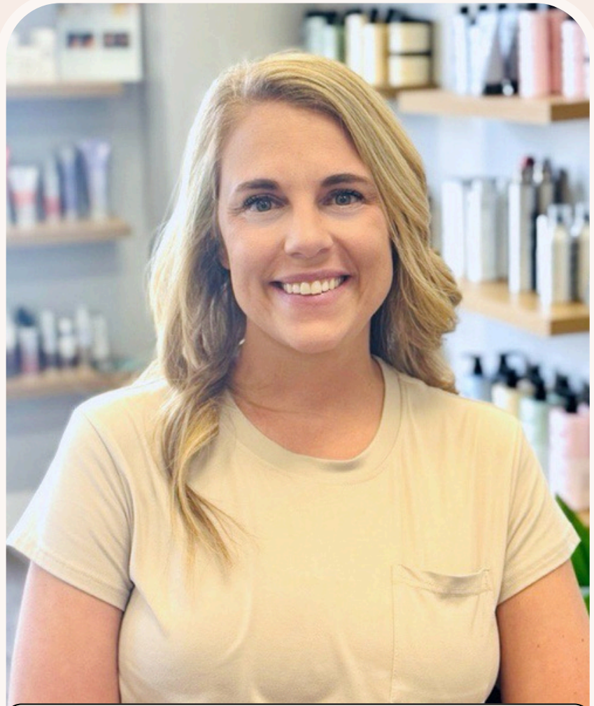
Guest Service Coordinator