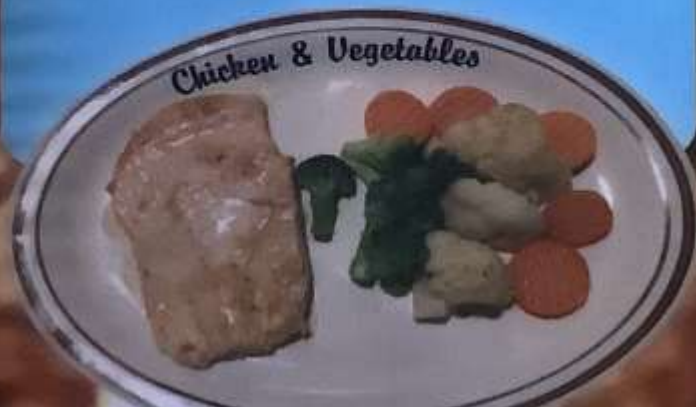
Chicken & Vegetables