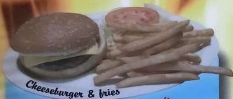
Cheeseburger & fries