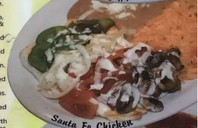
Santa Fe Chicken