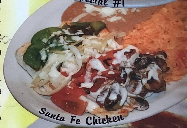
Santa Fe Chicken