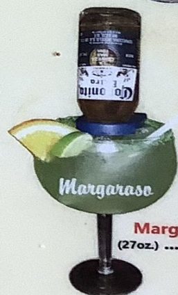
Margaraso (27oz.) ... $12.99

Piña Loca ... $9.99 (average 16oz.) A pineapple mug filled with your favorite Margarita or Daiquiri. (Mango, Lime, Piña Colada, Strawberry)