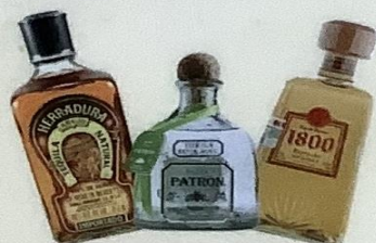
Tequila Shot ... $7.00

Jose Cuervo, Don Julio, 1880, Cazadores, Reposado, Patron, Herradura, and many more.