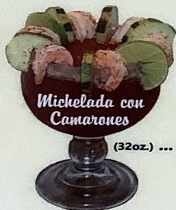
Michelada con Camarones