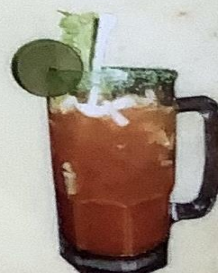
Michelada (32oz.) ... $8.99 Made with beer, lime juice, assorted sauces, spices, and peppers in a salt-rimmed glass.

Jose Cuervo, Don Julio, 1880, Cazadores, Reposado, Patron, Herradura, and many more.