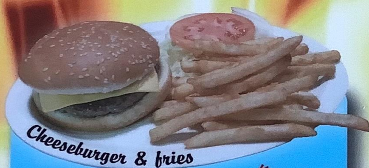
Cheeseburger & fries