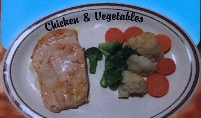
Chicken & Vegetables