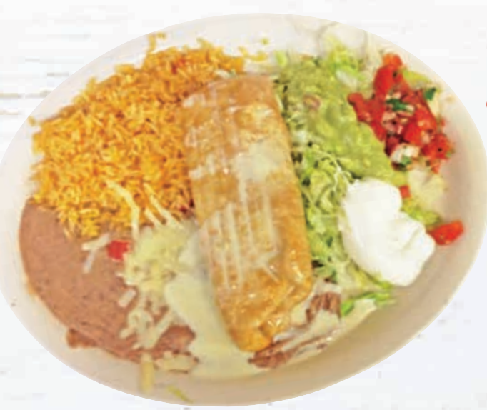
Add cheese sauce to your food -1.50

Four rolled corn tortillas stuffed with beef or chicken and deep fried. Served with lettuce, guacamole, pico de gallo and sour cream - 10.50