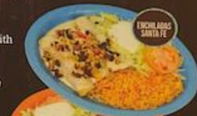
ENCHILADAS SANTA FE

(3) Grilled chicken enchiladas topped with cheese dip and santa fe corn mix. Served with rice and crema salad. 13.99