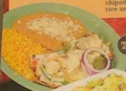
POLLO EL JARAPEO