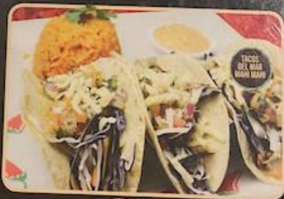
TACOS DEL MAR MAHI MAHI

(3) mahi-mahi fish tacos topped with purple cabbage, regular cabbage, pico de gallo, and shredded cheese. Served with rice and a side of chipotle sauce. 18.99