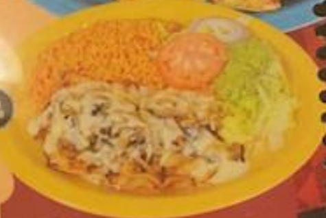
POLLO SAN JOSE