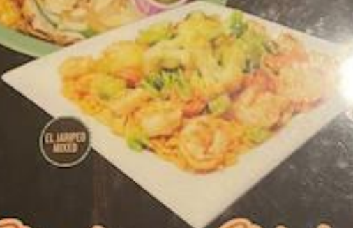
EL JARAPEO MIXED