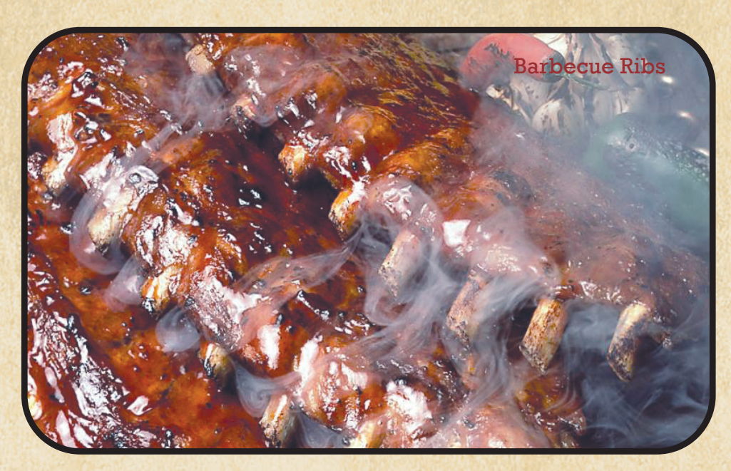
* THESE ITEMS MAY CONTAIN RAW OR UNDERCOOKED INGREDIENTS. CONSUMER ADVISORY: THE DEPARTMENT OF PUBLIC HEALTH ADVISES THAT EATING RAW OR UNDERCOOKED MEAT, POULTRY, EGGS, OR SEAFOOD POSES A HEALTH RISK TO EVERYONE, BUT ESPECIALLY TO THE ELDERLY, YOUNG CHILDREN UNDER AGE FOUR, PREGNANT WOMEN, AND OTHER HIGHLY SUSCEPTIBLE INDIVIDUALS WITH COMPROMISED IMMUNE SYSTEMS. THOROUGH COOKING OF SUCH ANIMAL FOODS REDUCES THE RISK OF ILLNESS.

Butterfly Shrimp Tender shrimp, lightly battered and deep-fried golden 13.99