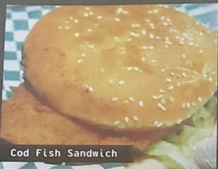
Cod Fish Sandwich