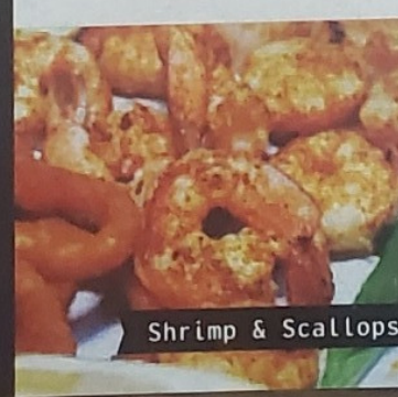
Shrimp & Scallops