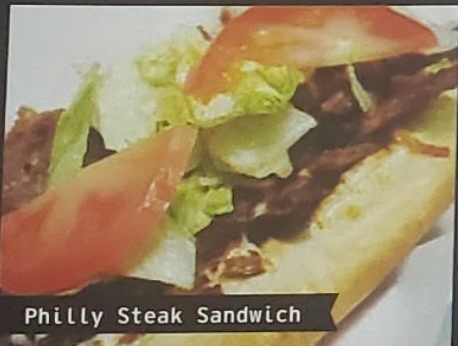
Philly Steak Sandwich