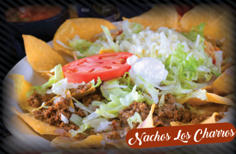
Nachos Los Charros

All take out order are an additional .50