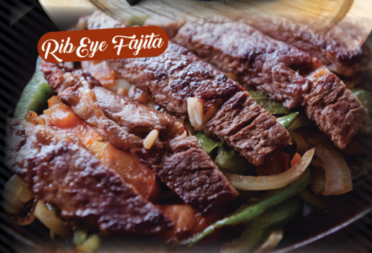
Rib Eye Fajita