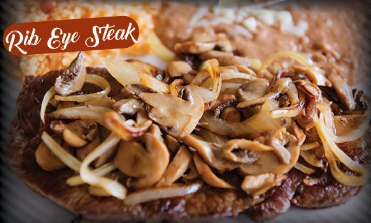
Rib Eye Steak