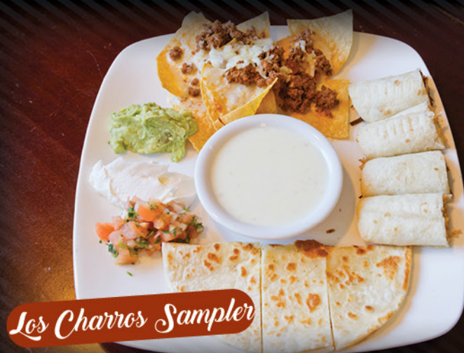
Los Charros Sampler