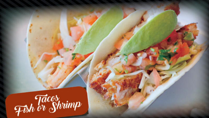
Tacos Fish or Shrimp

Cabbage, pico de gallo, avocado slices, and chipotle sauce on the side