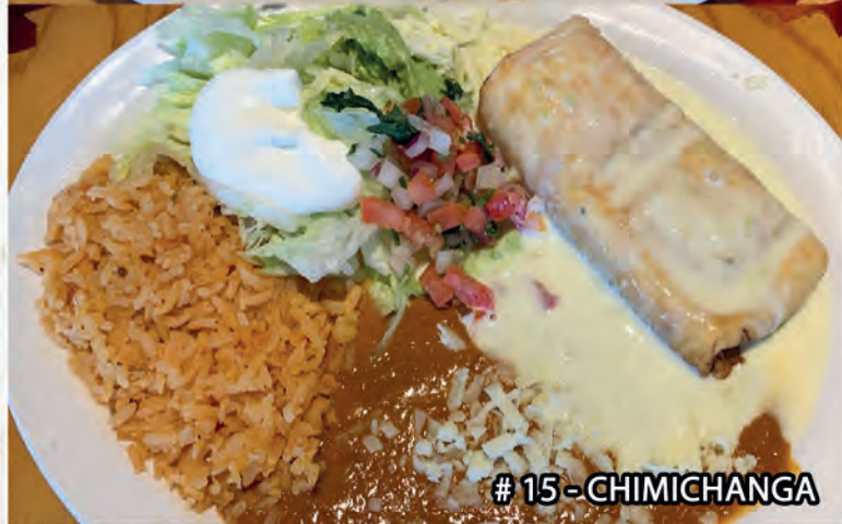
# 15 - CHIMICHANGA