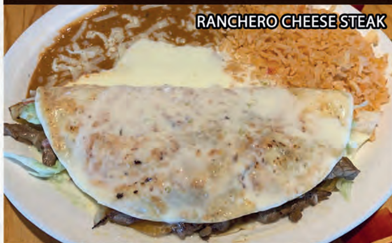
RANCHERO CHEESE STEAK

* All Take Out Orders ADD - .55¢ We use 100% vegetable oil.