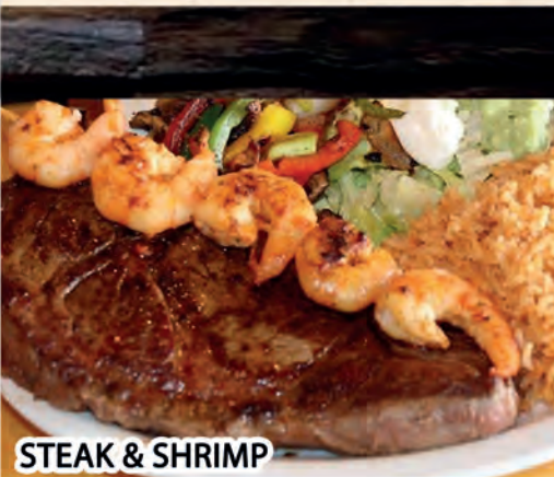
STEAK & SHRIMP

Grilled chicken breast topped with our cheese sauce. Served with rice, beans and tossed salad. $13.99