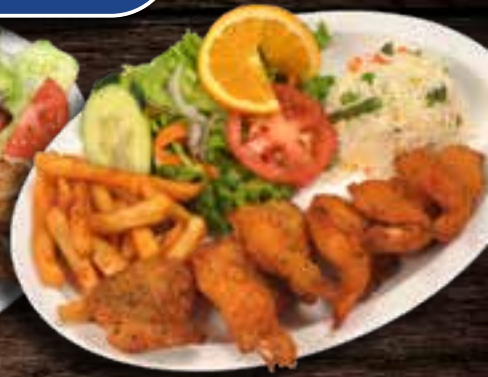
Camarones Empanizados 23 99 Breaded shrimp