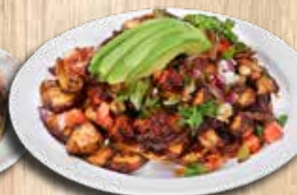
Tostada de Pulpo Caliente

CONSUMER ADVISORY Items marked with an asterisk (*) are served raw, undercooked or cooked to order. Consuming raw or undercooked meat, poultry, seafood, shellfish, or eggs may increase your risk of foodborne illness, especially if you have certain medical conditions AVISO AL CONSUMIDOR Los artículos marcados con un asterisco (*) se sirven crudos, poco cocidos o son cocinados a pedido del cliente. El consumo de alimentos crudos o poco cocidos como carne, aves, mariscos o huevos puede aumentar el riesgo de enfermedades transmitidas por alimentos, especialmente si usted tiene ciertas condiciones médicas