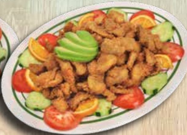
Chicharrón de Pescado 26 99 Fish chicharrón