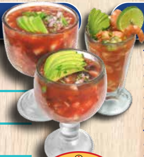
* Coctel de Ostión Raw oyster Sm 12 99 Md 17 99 Lg 24 99