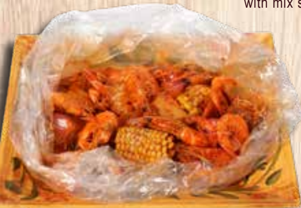
Bolsa de Mariscos