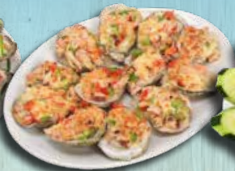
Ostiones Gratinados * (6) 17 99 (12) 32 50 Rockefeller oysters, baked with surimi, octopus, green pepper, red pepper topped with melted cheese