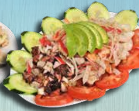
Botana Mixta 34 * Shrimp, octopus, surimi, shirmp ceviche and scallops. Served cold