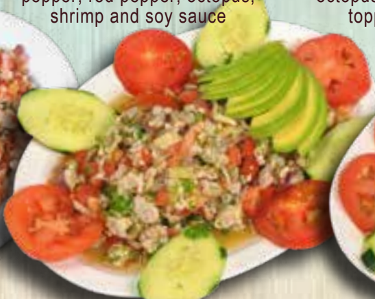
Ceviche de Camarón Sm 14 99 Lg 24 99 Shrimp ceviche