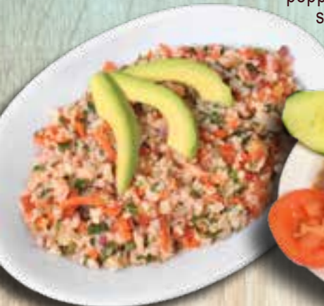
Ceviche de Pescado Sm 13 99 Lg 22 99 Fish ceviche