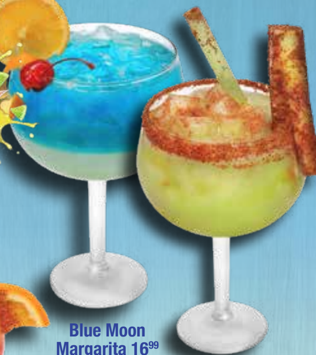
Blue Moon Margarita 16 99 Made with Blue Curacao