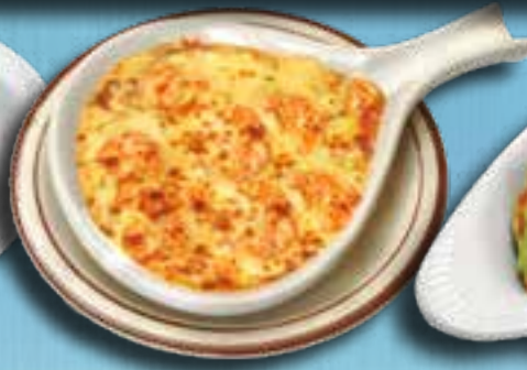
Queso Fundido Melted cheese Plain 11 99 With Shrimp 14 99 With Steak 14 99 With Chorizo 14 99