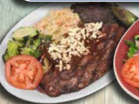
Carne a la Tampiqueña