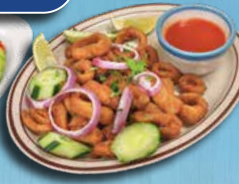
Calamares Fritos 19 99 Fried Calamari