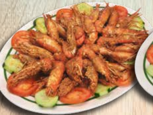
Langostinos Nayarit MP$ Sm Lg Jumbo Prawns in our special Nayarit sauce