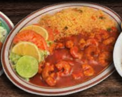
Camarones a la Diabla 21 50 Shrimp in spicy devil sauce