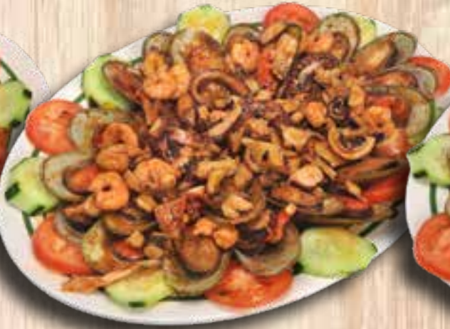
Mejillones Especiales 44 99 Mussels Nayarit style with chapuzón