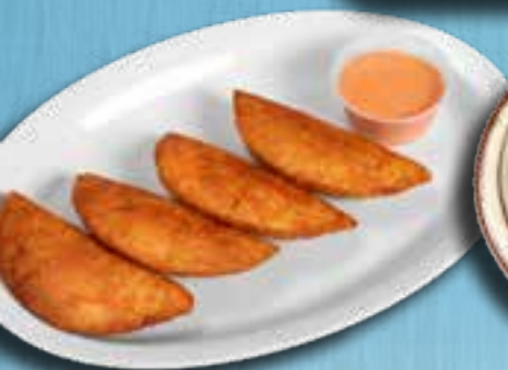
Empanadas Shrimp empanadas (4) 12 99 (8) 22 50