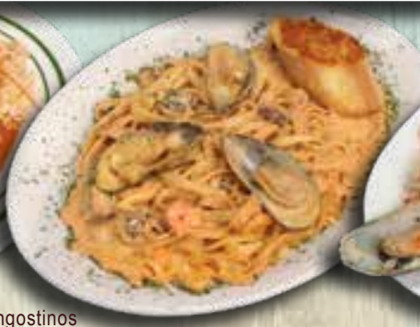
Pasta Costa Brava 24 99

Prawns to your liking A La Diabla Spicy devil sauce Al Ajo Garlic sauce A La Mantequilla Butter sauce Rancheros Mild tomato sauce Nayarit Nayarit style sauce