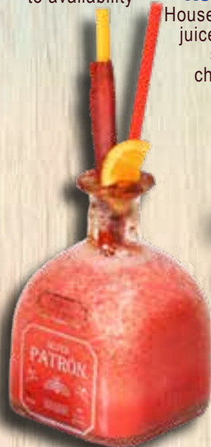
Margarita Océano 25 99 Your choice of tequila blanco or reposado: Don Julio or Patrón and Grand Marnier