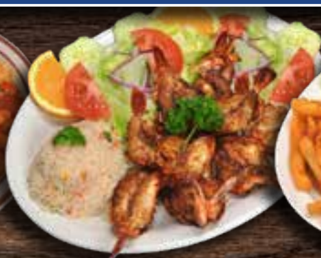
Camarones Zarandeados 23 99 Shrimp on the griddle Nayarit style