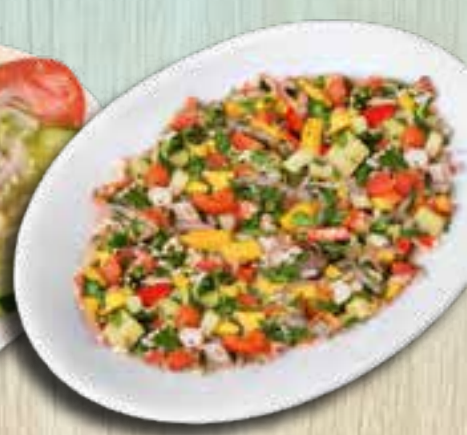
Ceviche Hawaiiiano 24 99 Shrimp & mango ceviche