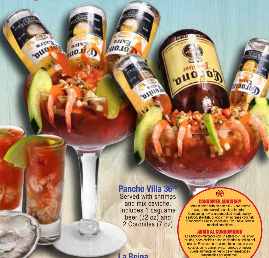
Pancho Villa 36 99 Served with shrimps and mix ceviche. Includes 1 caguama beer (32 oz) and 2 Coronitas (7 oz)

CONSUMER ADVISORY Items marked with an asterisk (*) are served raw, undercooked or cooked to order. Consuming raw or undercooked meat, poultry, seafood, shellfish, or eggs may increase your risk of foodborne illness, especially if you have certain medical conditions AVISO AL CONSUMIDOR Los artículos marcados con un asterisco (*) se sirven crudos, poco cocidos o son cocinados a pedido del cliente. El consumo de alimentos crudos o poco cocidos como carne, aves, mariscos o huevos puede aumentar el riesgo de enfermedades transmitidas por alimentos, especialmente si usted tiene ciertas condiciones médicas