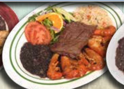
Mar y Tierra Con Langostinos