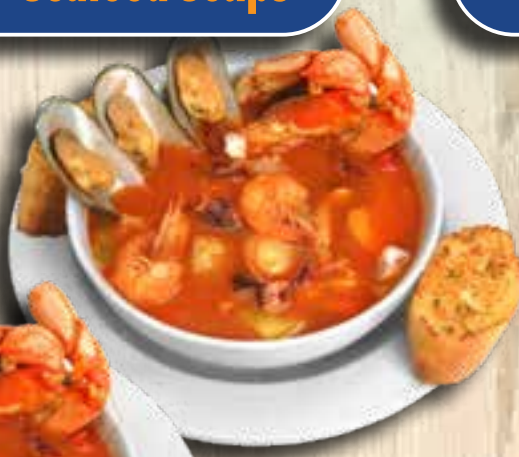
Caldo Siete Mares