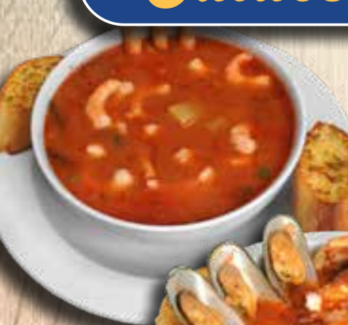
Caldo de Camarón