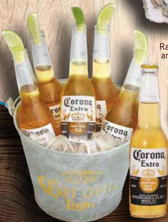
Cubetazo (6 bottles) Domestic 25 00 Imported 29 95