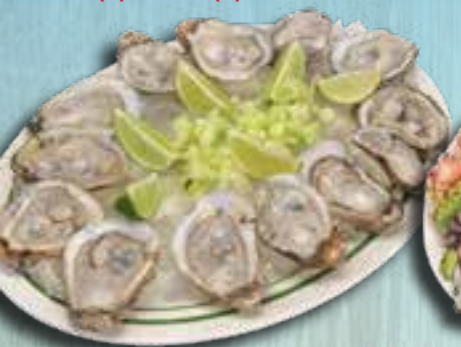
Ostiones en su Concha * (6) 12 99 (12) 23 50 Raw oysters