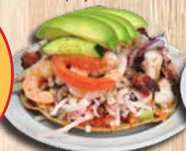
Tostada Mixta Fria