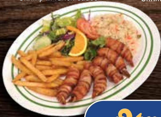
Camarones Momias 24 99 Jumbo shrimps with cheese wrapped with bacon