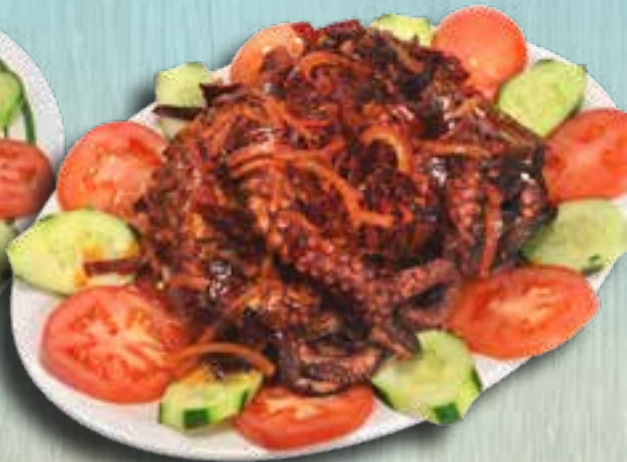
Pulpo Especial 39 99 MP$ Octopus in ajillo sauce SPICY!