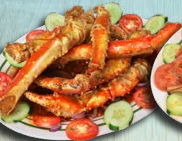
King Crab Legs MP$