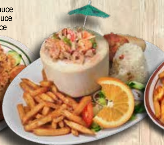
Coco Relleno 22 99

Serves 2 people 34 99 Our exclusive recipe of rice with mix seafood