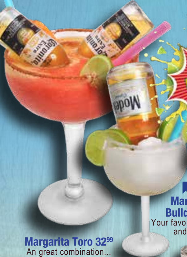
Margarita Bulldog 20 99 Your favorite margarita and a beer