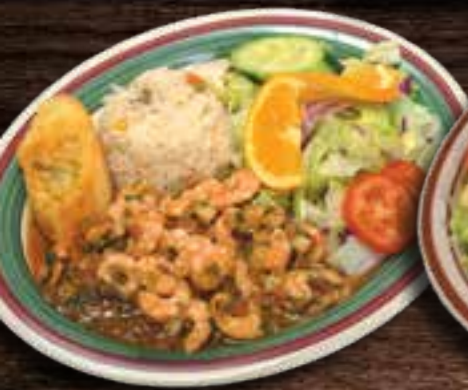
Camarones Rancheros 21 50 Shrimp in ranch sauce