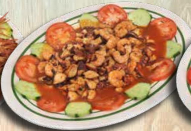
Chapuzón del Mar Sm 28 99 Lg 49 99 Shrimp and octopus in our special mild sauce