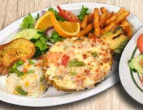
Piña Rellena 24 99

Pasta with seafood mix: octopus, mussels, scallops and shrimp with Alfredo sauce