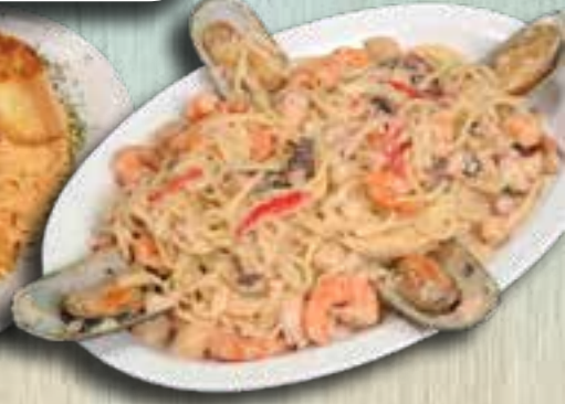
Pasta Vallarta 24 99

Pasta with seafood mix: octopus, mussels, shrimp with a hot sauce