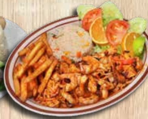
Platillo de Chapuzón 23 99