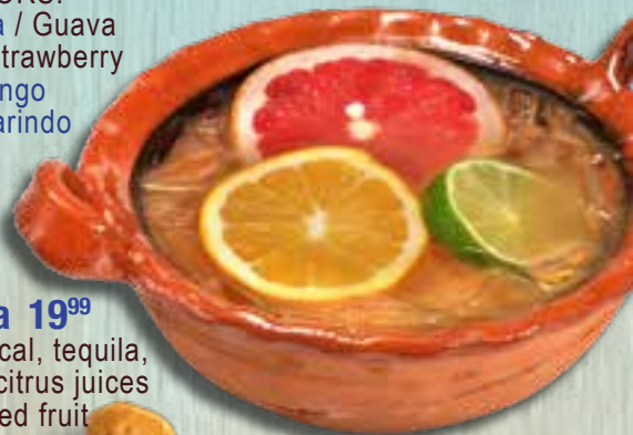
Cazuelita 19 99 Made with mezcal, tequila, pineapple and citrus juices and chopped fruit