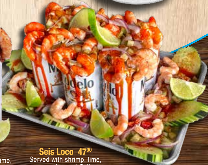
Seis Loco 47 00 Served with shrimp, lime, cucumber and Tajin