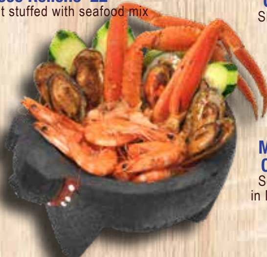
Molcajete Cora 36 99