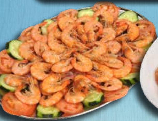
Camarones al Vapor 28 99 Steamed shrimps