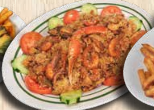
Paella del Mar

Pineapple stuffed with seafood mix and melted cheese