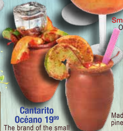
Cantarito Océano 19 99 The brand of the small bottle of tequila may vary and is subject to availability