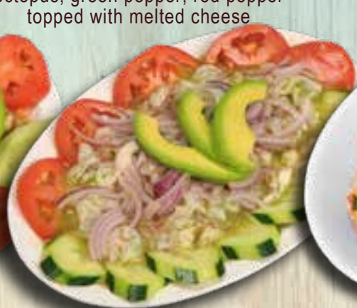
Camarones Aguachile 22 99 * Raw shrimp marinated in fresh lime juice and hot green sauce SPICY!