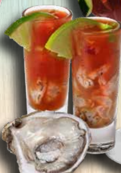
Balazos! 4 95 EACH * Raw oyster with lime juice and assorted sauces and spices

CONSUMER ADVISORY Items marked with an asterisk (*) are served raw, undercooked or cooked to order. Consuming raw or undercooked meat, poultry, seafood, shellfish, or eggs may increase your risk of foodborne illness, especially if you have certain medical conditions AVISO AL CONSUMIDOR Los artículos marcados con un asterisco (*) se sirven crudos, poco cocidos o son cocinados a pedido del cliente. El consumo de alimentos crudos o poco cocidos como carne, aves, mariscos o huevos puede aumentar el riesgo de enfermedades transmitidas por alimentos, especialmente si usted tiene ciertas condiciones médicas