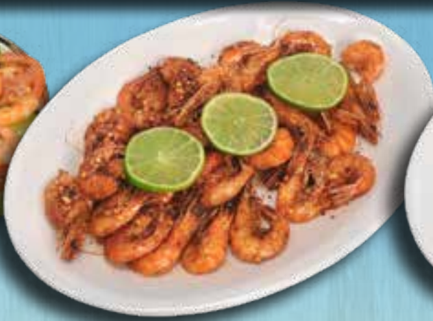
Camarones Coras 28 99 Deep fried shrimps with chile de árbol