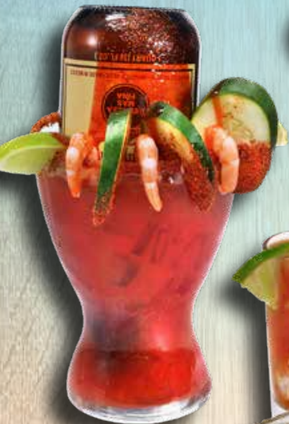
El Pachoncito 22 99 With a 32 oz beer