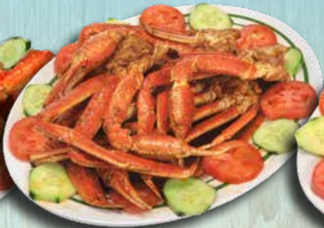
Patas de Jaiba MP$ Sm Lg