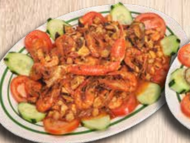
Levantamueertos Sm 42 99 Lg 79 99 Shrimp, mussels, crab leg, octopus and scallops in our Nayarit sauce