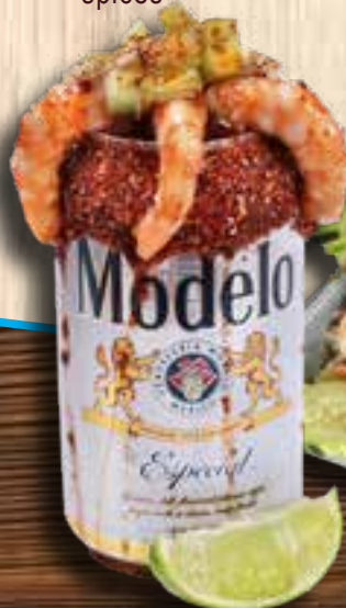
La Dejada 8 99 Served with shrimp, lime, cucumber and Tajin