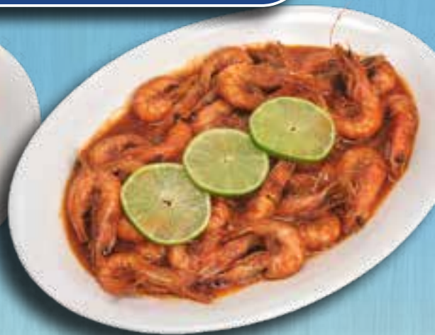
Camarones Cucaracha 28 99 Deep fried shrimps in Huichol sauce