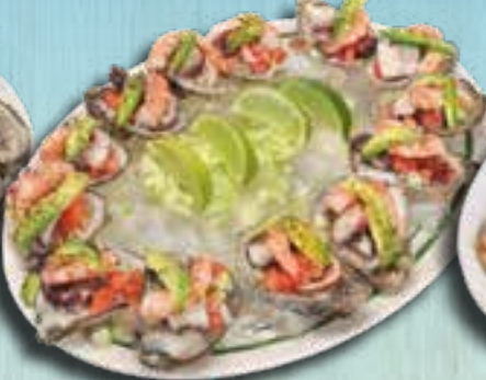
Ostiones Especiales * (6) 17 99 (12) 32 50 Raw oysters with onion, green pepper, red pepper, octopus, shrimp and soy sauce