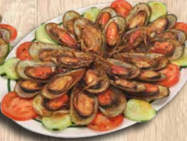
Mejillones Sm 18 99 Lg 32 99 Mussels Nayarit style