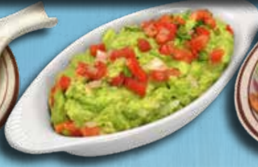
Guacamole 11 99