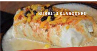
BURRITO EL VAQUERO