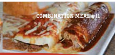
COMBINATION MEAL #11