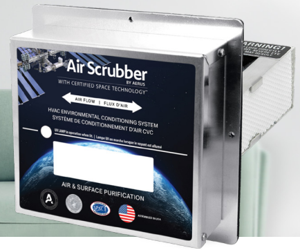
New Patented Cell Design