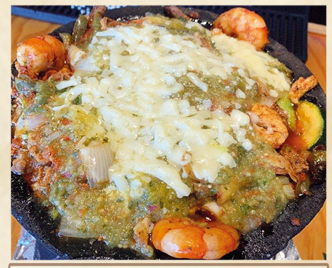
* Consuming raw or undercooked meats, poultry, seafood, shellfish or eggs may increase your risk of foodborne illness.