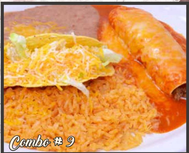
Combo # 9

Black beans also available upon request 1) Enchilada, chile con queso, and 2 tacos. 4) Enchilada, chile relleno, and 2 tacos 5) Burrito, enchilada, and taco 6) 2 Tacos, rice, and beans 7) Enchilada, tamale, rice, and beans 8) Enchilada, chile relleno, rice, and beans 9) Enchilada, taco, rice, and beans 10) 2 Enchiladas, rice, and beans 12) Taco, 2 enchiladas, and rice 13) Burrito, enchilada, and chile relleno 15) Burrito, enchilada, and tamale 16) Burrito, enchilada, rice, and beans 22) Chile relleno, taco, rice, and beans 25) Burrito, taco, rice, and beans