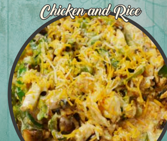
Chicken and Rice

Chicken grilled with bell peppers and mushrooms served over a bed of rice and smothered with cheese sauce. 17.99