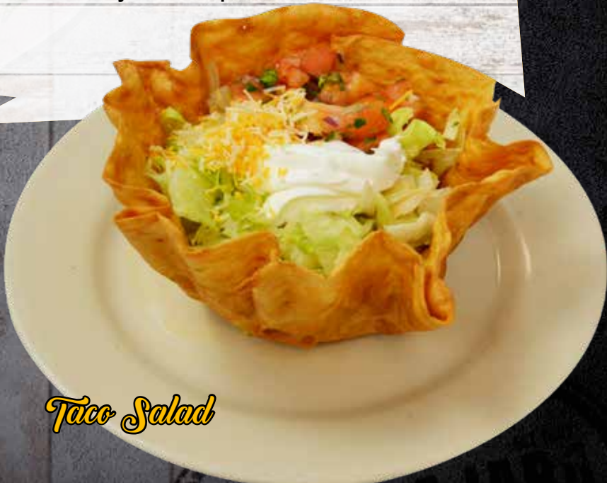
Chicken Tortilla Soup

Taco Salad Dare to salad differently! Crispy tortilla bowl with your choice of filling, topped with lettuce, guacamole, and sour cream (fajita options sautéed with onions, bell peppers, and tomato). Shredded Chicken or Ground Beef 13.99 Fajita Chicken or Steak 16.99 Fajita Shrimp 18.99 Grilled Salad Fresh crisp lettuce with tomatoes, bell peppers, onions, avocado, cheese and choice of chicken or shrimp 17.99 Chicken Tortilla Soup Large bowl filled generously with chicken broth, shredded chicken, rice, avocado, and pico, topped with crunchy tortilla strips and cheese. 14.99