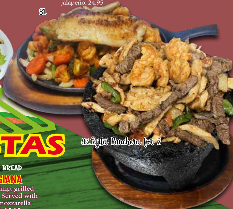
83. Fajita Ranchera for 2