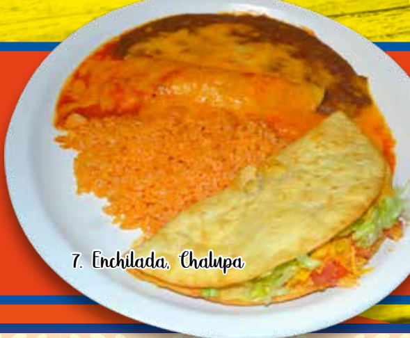
7. Enchilada, Chalupa