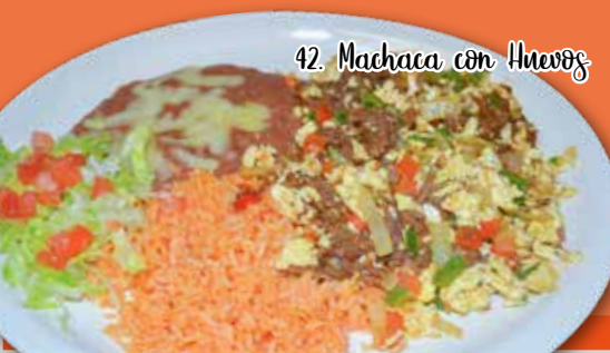
42. Machaca con Huevos

Shredded beef mixed with scrambled eggs, onions, grilled green peppers, and tomatoes. Garnished with lettuce and tomato. 13.95