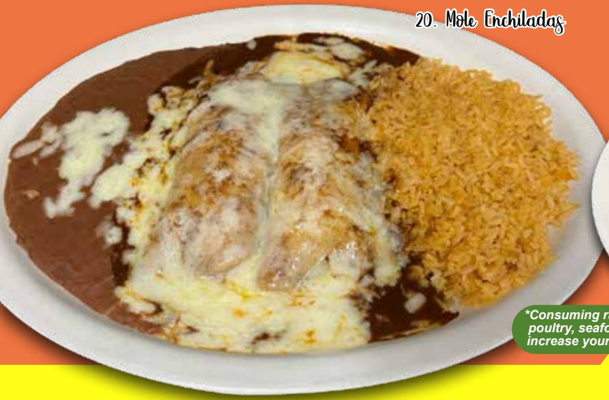
20. Mole Enchiladas

23.C. QUESABIRRIAS 3 Soft corn tortillas dipped in our special sauce and grilled. Stuffed with Monterey cheese and shredded beef. Garnished with lettuce, pico de gallo, and guacamole. 14.95