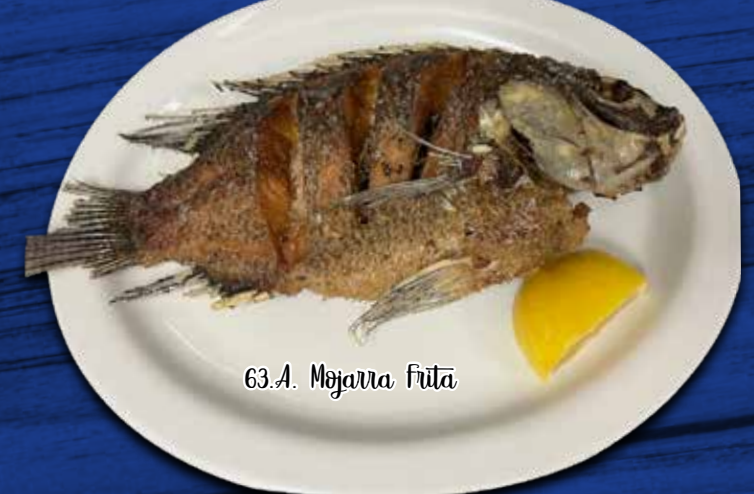
63.A. Mojarra Frita

Large flour tortilla filled with real crab meat and baby shrimp, cooked with tomatoes and green onions. Covered with burrito sauce and melted Monterey cheese. Garnished with lettuce, guacamole, sour cream, and tomato. 15.95