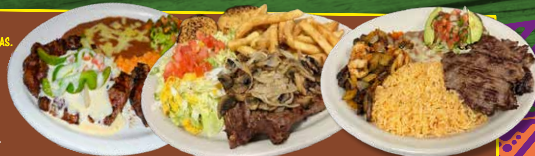
34. Steak Ranchero

Large flour tortilla stuffed with outside skirt steak, charbroiled, and onions. Covered with burrito sauce, melted Monterey cheese. Garnished with lettuce, pico de gallo, and guacamole. 15.95