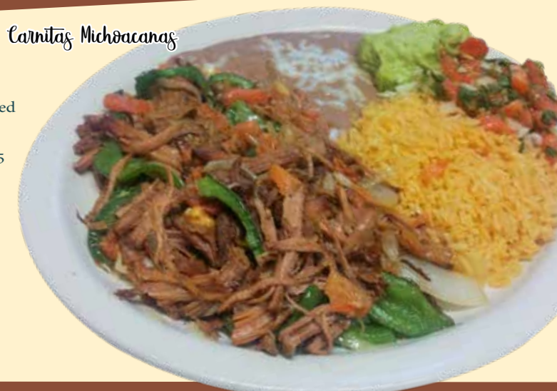
64. Carnitas Michuacanas

3 Soft corn tortillas stuffed with marinated pork, served with pineapple, cilantro, and onions. Garnished with pico de gallo, guacamole, and lime. 15.95