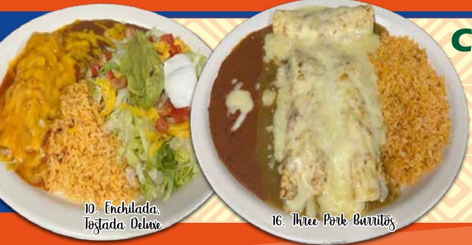
10. Enchilada Tostada Deluxe