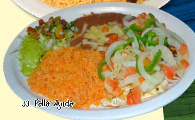
33. Pollo Asado