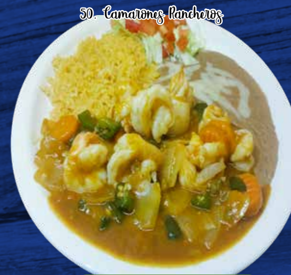
50. Camarones Rancheros

10 Large sautéed shrimp, onions, green peppers, tomatoes, bacon. Melted Monterey cheese on top. Garnished with lettuce and tomato. 16.95