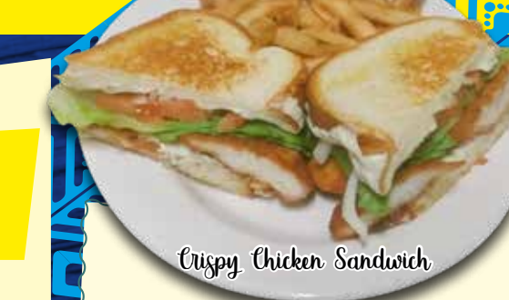
Crispy Chicken Sandwich

Charbroiled hamburger patty with melted mozzarella cheese, bacon, and sautéed mushrooms. Garnished with lettuce, onions, and tomatoes. 11.95