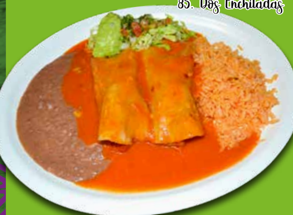
85. Dos Enchiladas

Large flour tortilla stuffed with cheddar cheese, grilled green peppers, onions, tomatoes, mushrooms, and spinach *No rice or beans.* 10.95