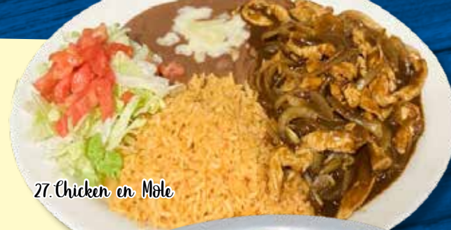
27. Chicken en Mole

Chicken tenders breaded and served with French fries. 12.95