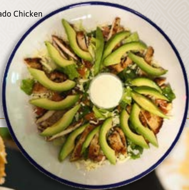
Avocado Chicken Salad

Grilled steak or chicken, rice and beans, topped with lettuce, sour cream, cheese and pico de gallo. $13.99