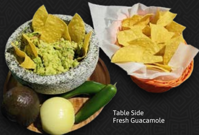
Table Side Fresh Guacamole